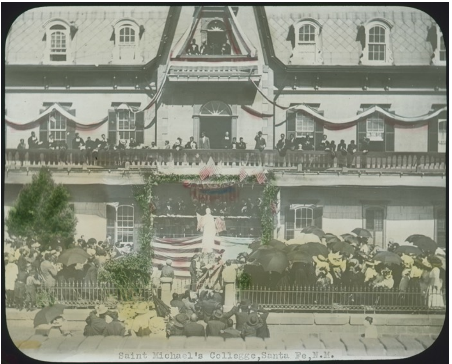
Photo: St. Michael's Dormitory circa 1915, Courtesy Palace of the Governors Photo Archives (NMHM/CDA) Negative no. LS.0469