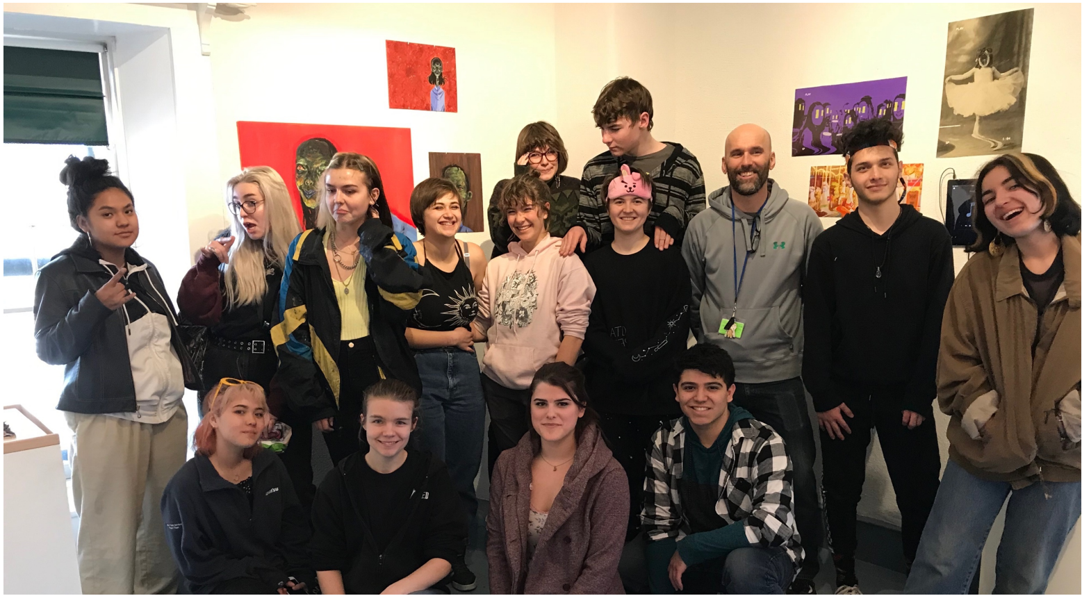
Image above, New Mexico School for the Arts Junior NMSA Visual Arts class. Their exhibition Decomposition is currently on display at HSFF's El Zaguán through March 29, 2019.