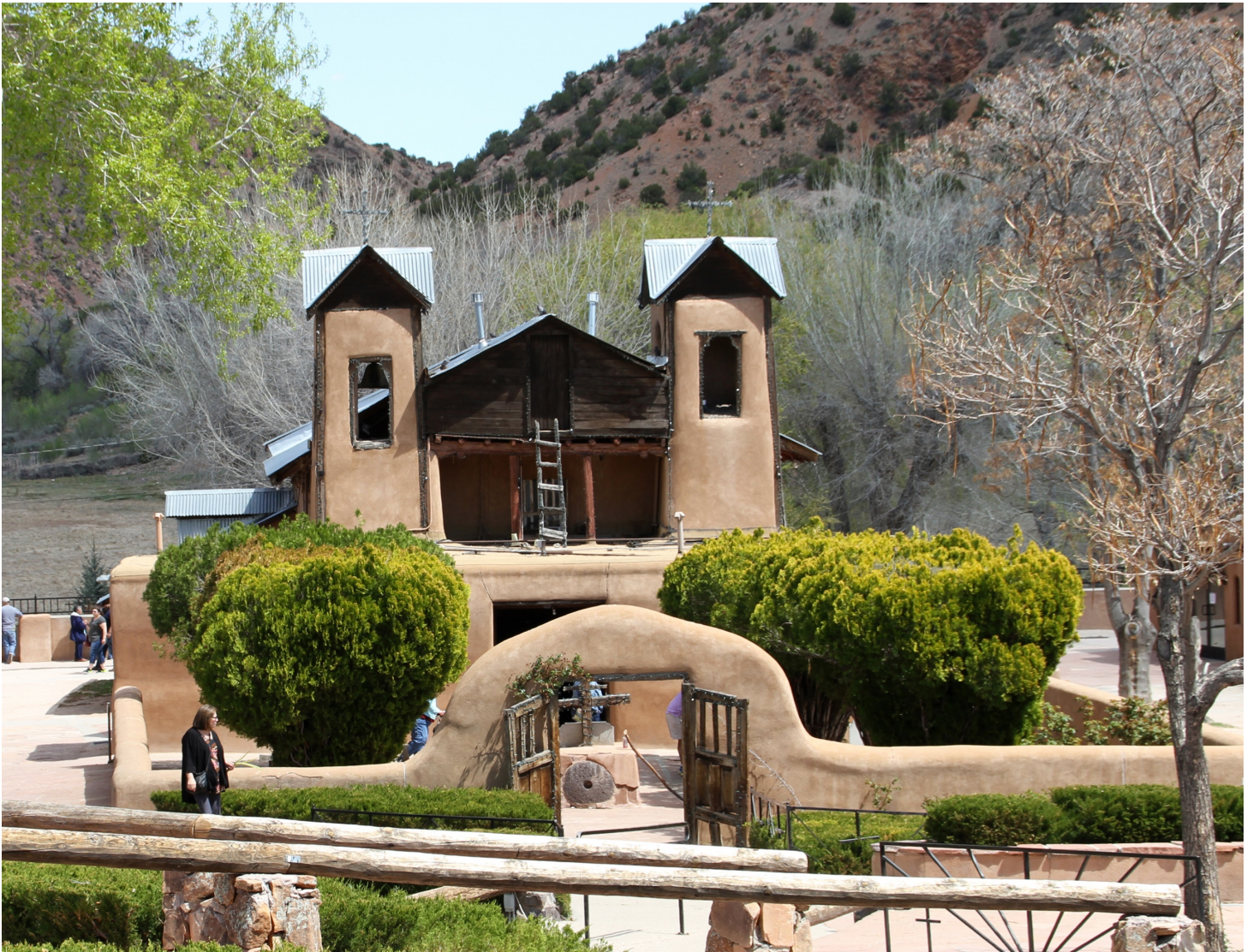
© Frank Graziano. Santuario de Chimayo, Chimayo, NM

utilize their churches in real time. South then to Laguna Pueblo and San José, the Saint Joseph Mission Church, where he discusses with tribal members the parallel acceptance and existence of their ancient religion with Catholicism, emphasized by an Eagle Dance within the church, emptied of pews, on Christmas Eve. “Catholicism was thus integrated into Pueblo culture on its own terms, modifying but not displacing core native values and traditions.” At Acoma and its massive San Esteban del Rey church, the co-existence or co-mingling of pueblo beliefs and Catholicism takes a slightly divergent approach, as the Spanish religion was imposed by brutal conquest, not by request as at Laguna. Graziano notes that the church “is as integral to native traditions – or more so – than it is to the Catholicism of its origins.”