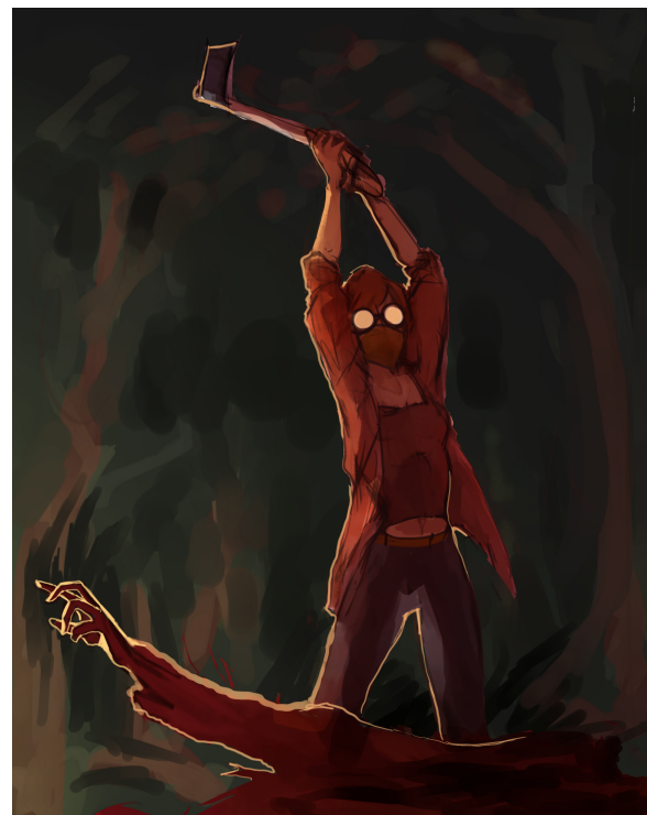
© Andrea Bruno, Happy Camper , 2019, comic panel