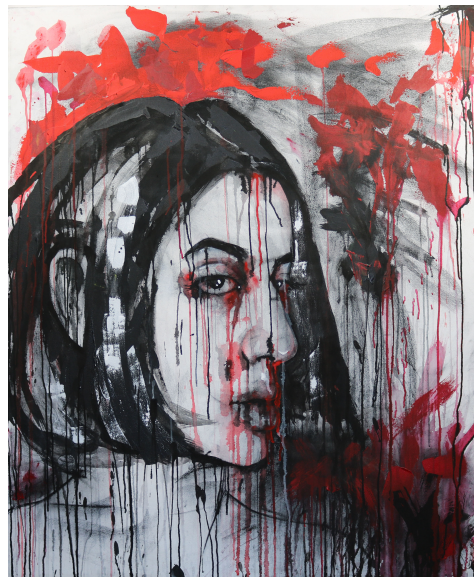
© Lavina Sage Gray, abhorrence , charcoal, india ink, and acrylic paint, 53"x46"

thesis exhibition. This vision includes noting successes, things to improve, challenges, and skills gained that relate to both collective and personal production. This experience has provided these students with tools and skills to be further developed and reinforced in order to present a challenging, thought provoking and forward thinking Senior Thesis Exhibition together.