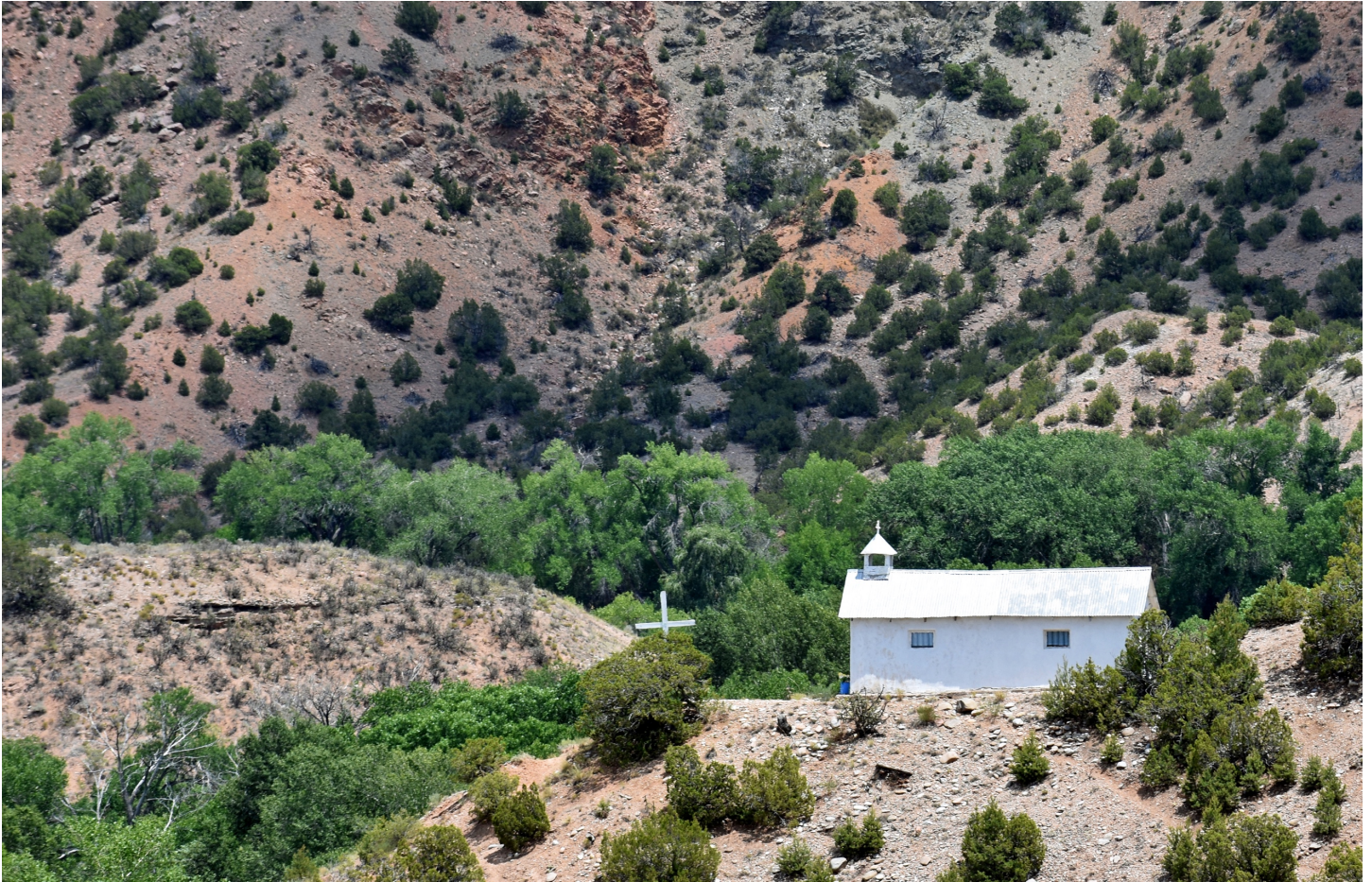
San Antonio, Chimayo, NM