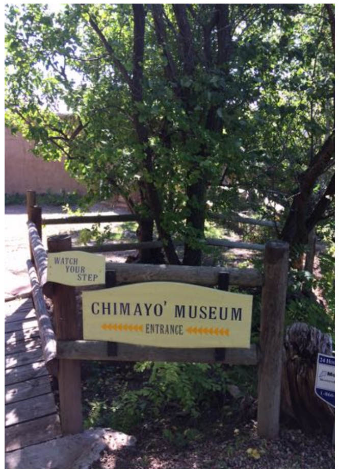
demand for my books on Chimayó, especially the one dealing with the history of the plaza.