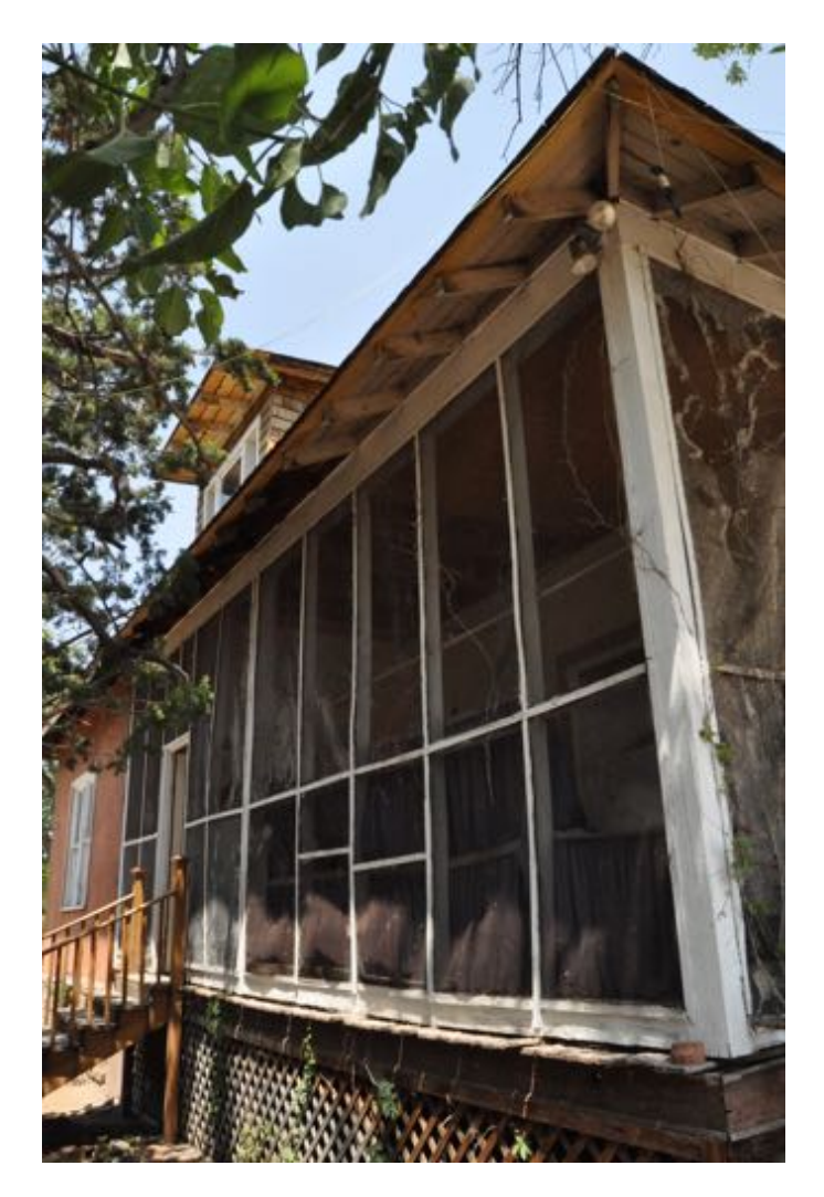
The Pinos Ranch House