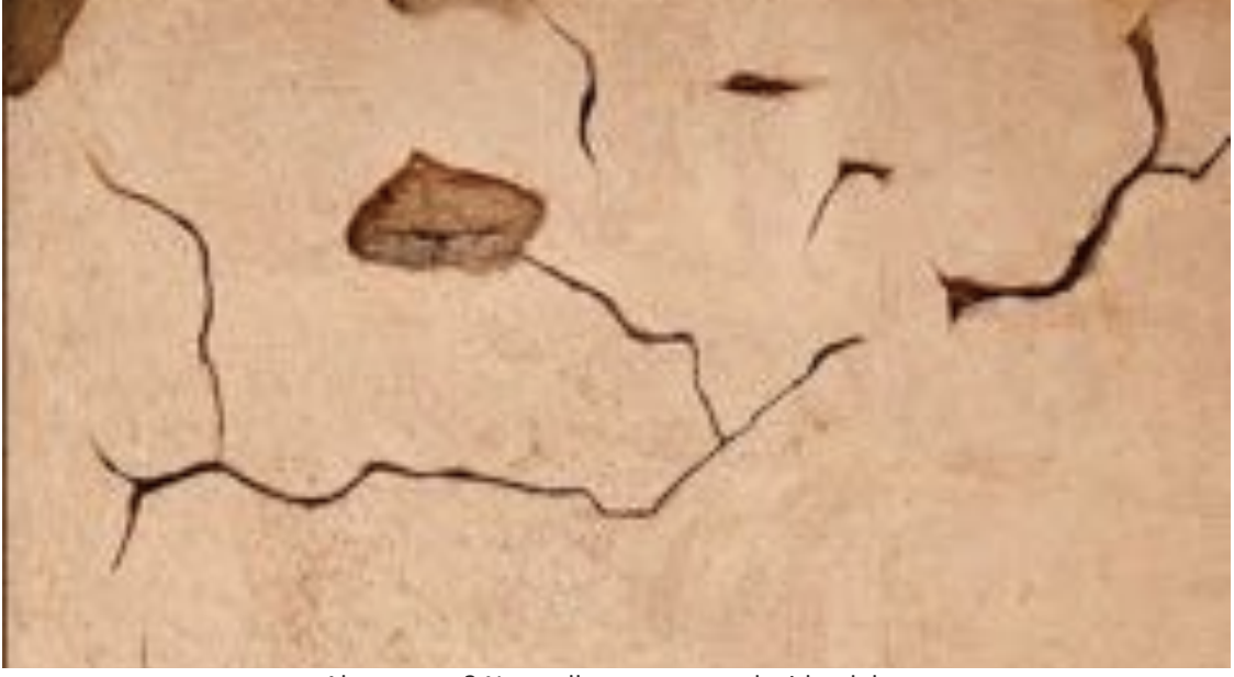
Abstract art? No, wall prep to remud with adobe.