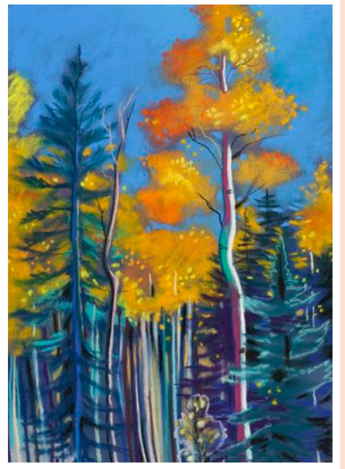
Image above: One in a Million , Sally Hayden von Conta from the exhibition The Color of Light on display in El Zaguán's sala until July 27, 2018.

Welcome p. 2 Book Review pp. 3-4 Interview pp. 5-7 In El Zaguán p. 8 Sponsors p. 9 Schedule p. 10 Staff, Board and Mission p. 11