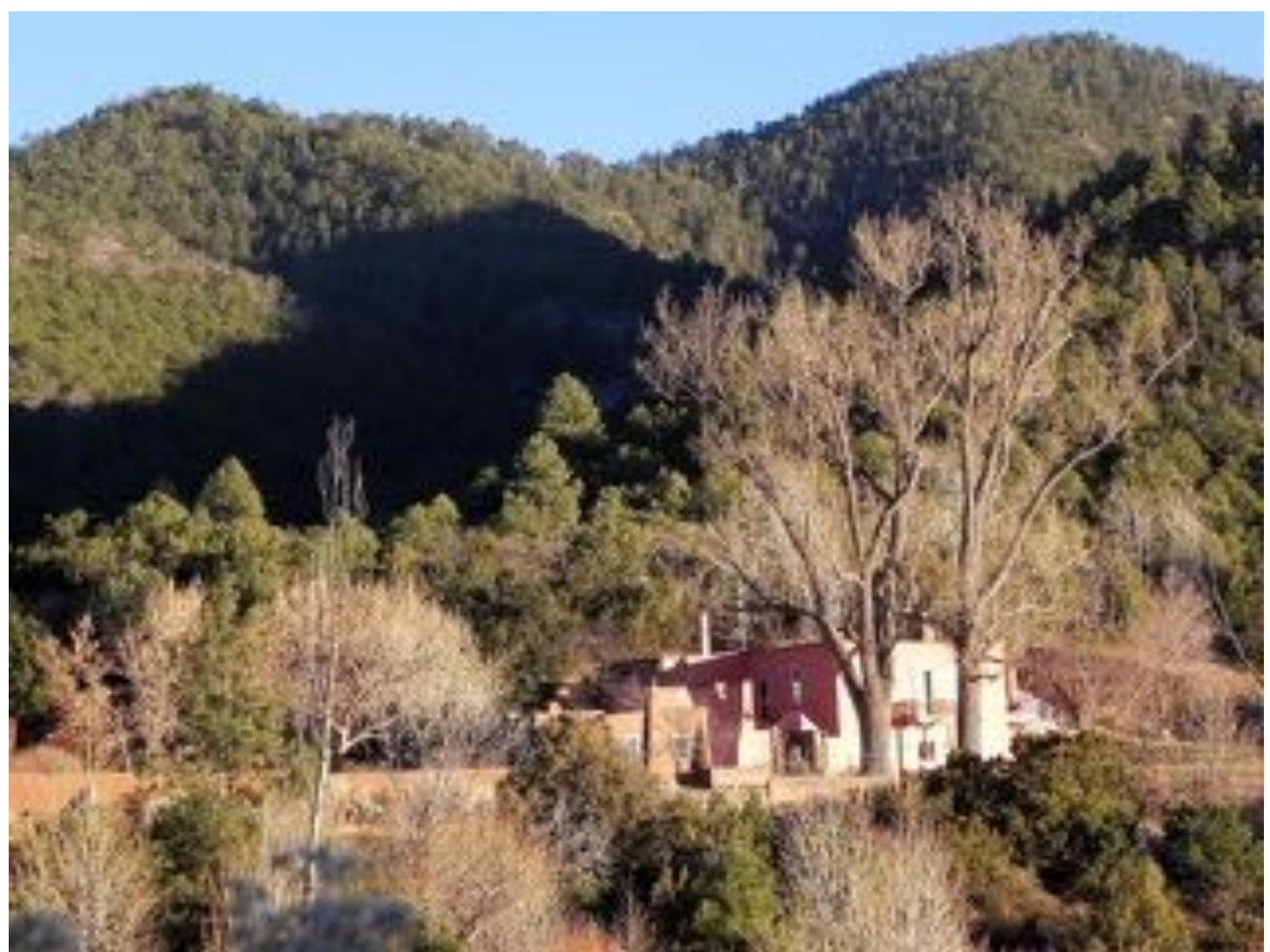
View of Randall Davey House, courtesy Watson Conserves, LLC. One of the tentative locations for the HSFF house tour in cooperation New Mexico Museum of Art's centennial celebration, School for Advanced Research, and Randall Davey Audubon Center.