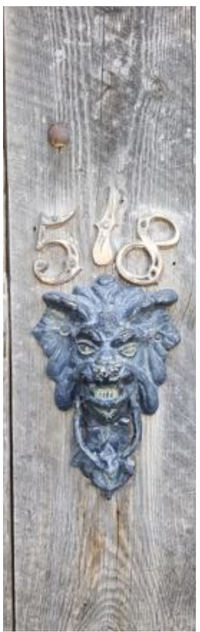
eZine cover: Courtesy of Mara Saxer from Santa Fe Botanical Gardens' Glow

Welcome p 2 Newsworthy pp 3-5 Interview pp 6-7 Bulletin Archives pp 8-9 Staff/Sponsors pp 10-11 Calendar p 12