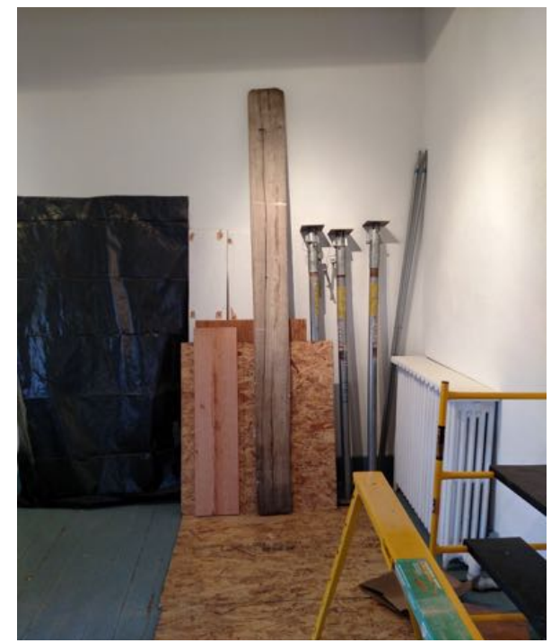
Materials at the ready.