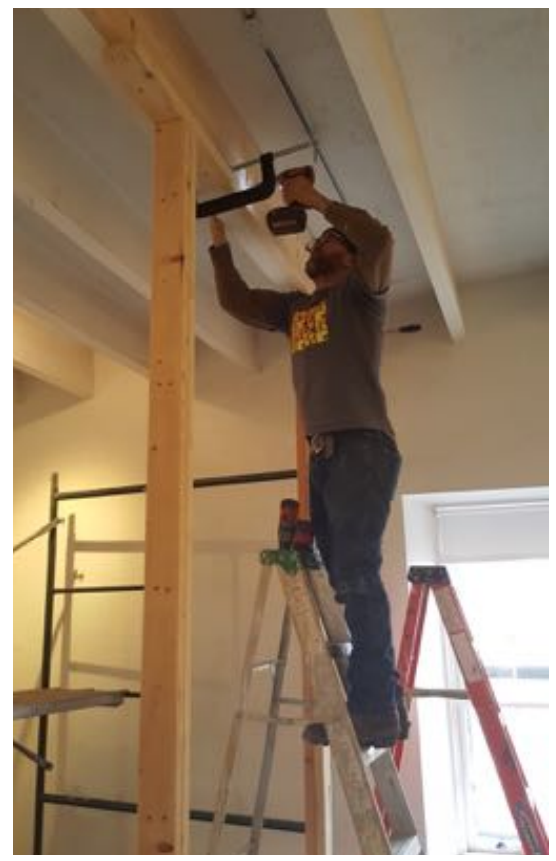
Temporarily attaching the first beam so it will stay in place while second is raised.