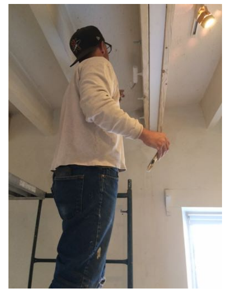
Beginning to prime repairs.