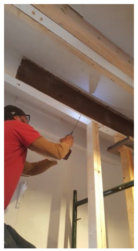
Cracked portions were given extra reinforcement with long screws.