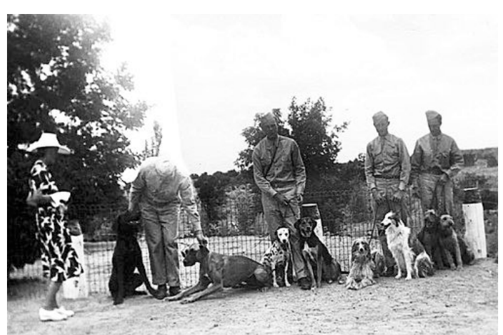
Dogs for Defense training at El Delirio, Santa Fe, August 1942.

SAR's web site at <u>https://sarweb.org/public-talks/</u>. The cost per lecture is $10, which may be purchased online or at the door. For information about the Historic Artist Home Tour, please visit <u>https://www.historicsantafe.org/artisthometour</u>. The cost is $30. Registration is required.