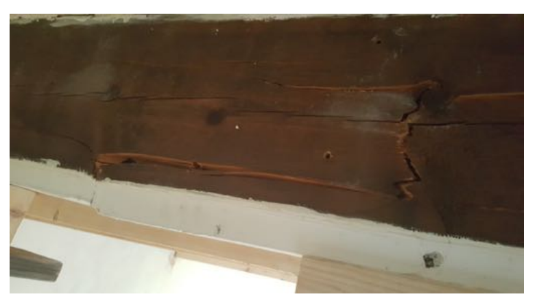
Cracks in the old beams.