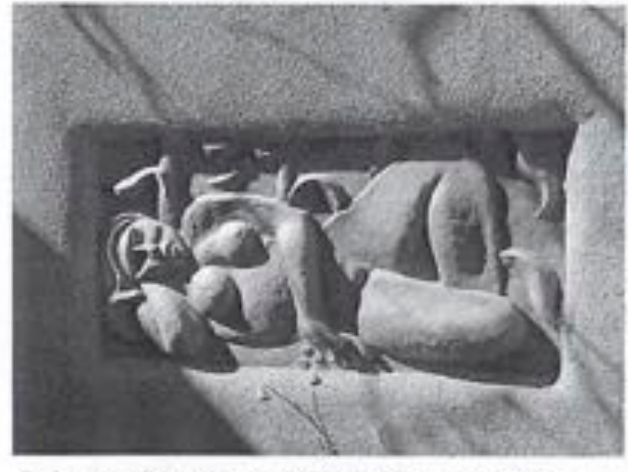
Earth as som today in a Santa Fe Garden.