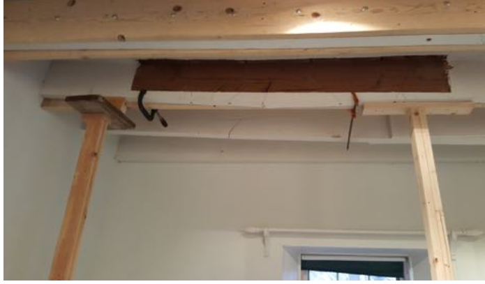
Older insufficient repairs were removed, revealing the extent of the damage.