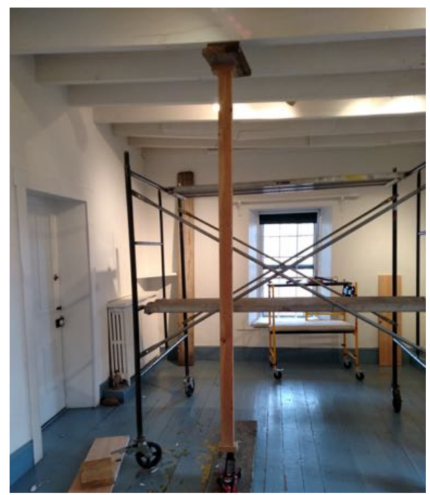
Temporary supports hold the damaged beams while work is done.