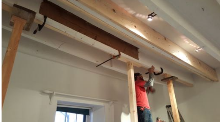
Attaching the first 'sister' to a beam, with fully repaired beam to right of photo.