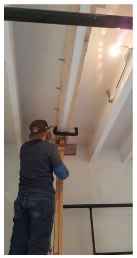
Once the sister beams are in place, they are bolted together forming a sandwich.