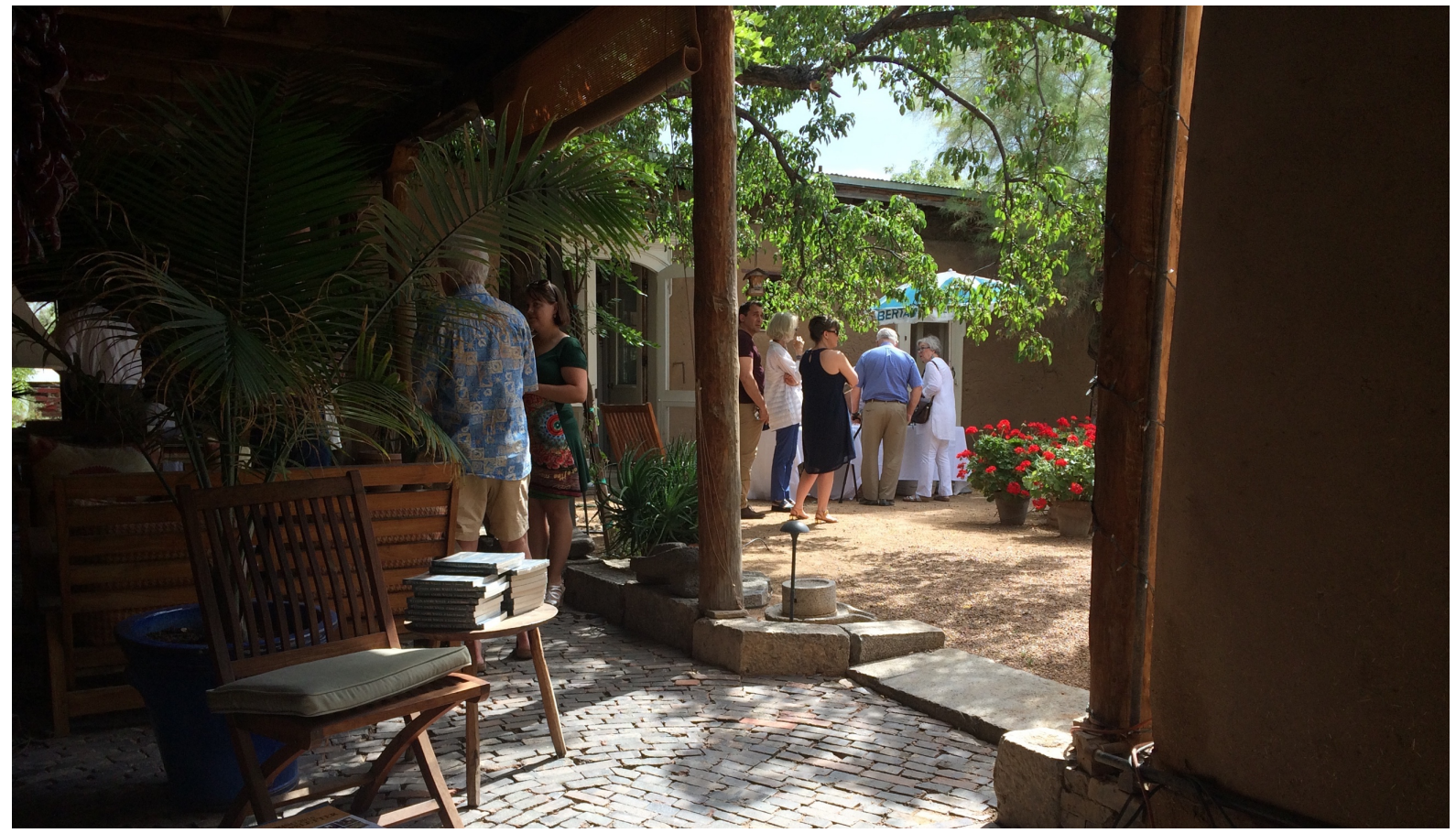
Image above, HSFF Stewards gathered in the courtyard of the Donaciano Vigil House in summer 2016