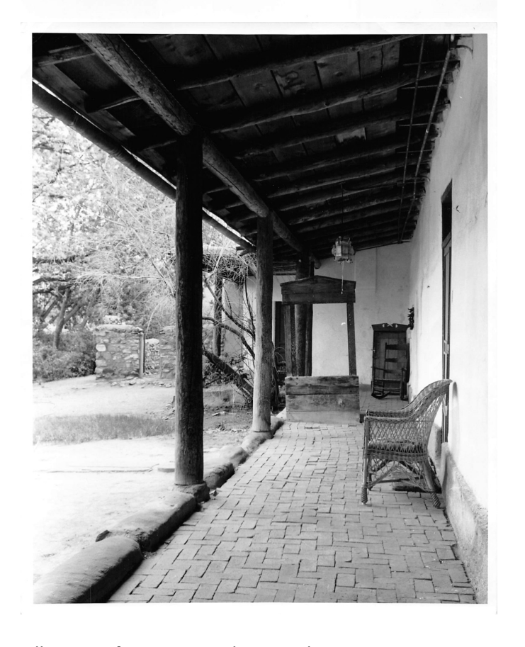
El Zaguán by Laura Gilpin.