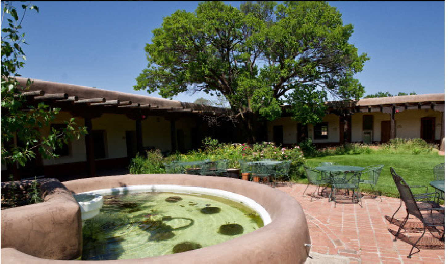
National Park Service Building on Old Santa Fe Trail, Santa Fe.