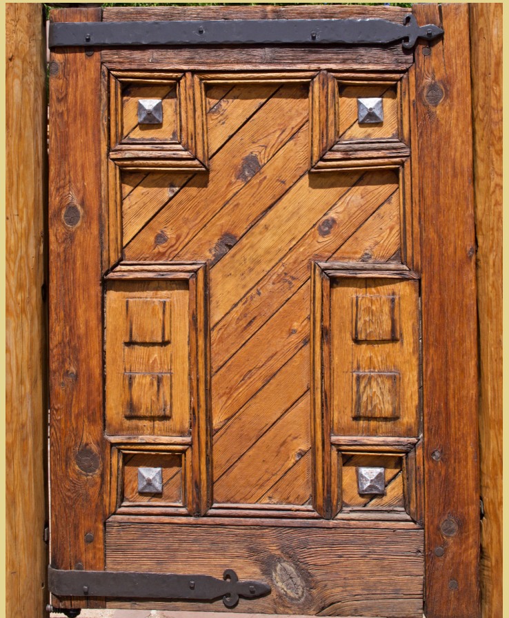
Photographs previous page, top counterclockwise: View from the White sisters' home, showing terraced landscaping, El Delirio/SAR, and White sisters' former home, now the administration building at the School for Advanced Research, This page: Lobato - Morley House