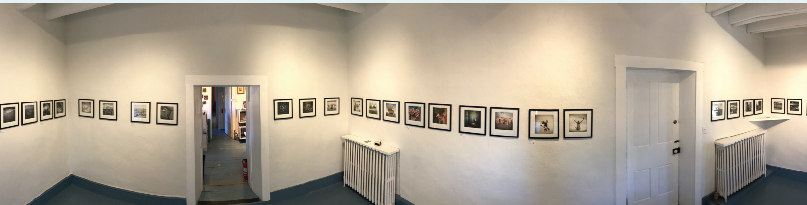
El Zaguán Sala with 20 New Mexico Photographers Pop-up Exhibition, November 2018

IN THIS NEWSLETTER THE HOVEY HOUSE & THE YEAR IN PICTURES