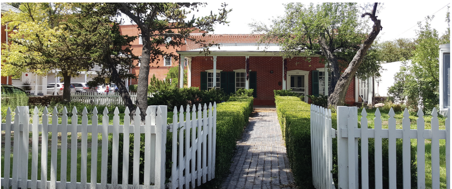
The Hovey House exterior in 2018

So as HSFF nears the close of 2018, we have confronted the issues first raised in print in 1982 that then ebbed and flowed over 36 years, the economic downturn of 2008 turning the tide of rents, maintenance, and commercial real estate values in this city, and engaged this committed, concerned, preservation non-profit in a hard look at its future. The Hovey House has been maintained to the best of our abilities, protected by a preservation easement that was welcomed by the new owners, and now set on a course of history for this city for the next 160 or so years. We are proud of our stewardship of this significant building and the role we played in saving it and preserving it. We look forward to implementing the programs and projects that will bring the cultural and architectural history of Santa Fe to more and more people in the future – citizens of the city and visitors – and our, the Historic Santa Fe Foundation's, next 57 years as a serious preservation leader in New Mexico.