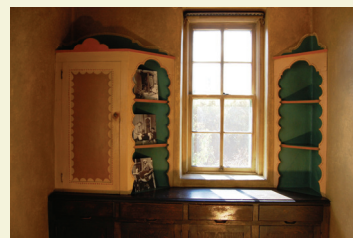
The easement protects important interior features, such as the handmade cabinets painted by Baumann (above) as well as exterior features including Baumann’s “Billy the Kid” birdbath (left).

owner mounted a large restoration effort with which we were intimately involved. In our role, we acted as an ombudsman for the significant historic features in the property.