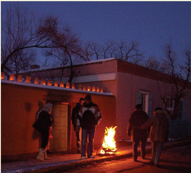
Above, old El Zaguán lit up with farolitos and a well-stoked luminario warm passersby. Although not traditional, hand painted farolito bags have become our signature at el Zaguán.

We always enjoy seeing our friends and neighbors.