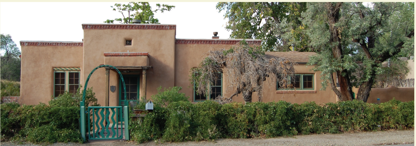
The Jane & Gustave Baumann House at 409 Camino de las Animas

In October, we finalized a Historic Preservation Easement on the Jane & Gustave Baumann House that will protect the house in perpetuity. Since the easement program started 15 years ago, the Historic Santa Fe Foundation has come to hold seven preservation easements (listed on page three). Easements allow us to expand our scope of protection without having to own and manage more properties.