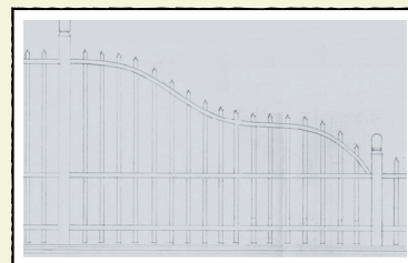
Above, one of many architectural drawings created by volunteers. This one of the west fence at El Zaguán, was drawn this summer by Graciela Tomé. These detailed drawings document our properties and aid in planning for future restoration work.

Not only was it a strenuous year for volunteers, we also needed a lot of financial help and we still do. Thanks also to all of our many donors , who help to make all of our work possible and who bring community into all of our efforts.